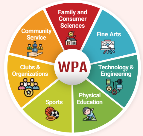
Additional Subjects Extracurricular Activities